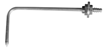
Static Probe Option

The SSS series DP probe is used for sensing velocity pressure in the duct. Available in 102 mm, 152 mm, 203 mm & 254 mm (4", 6", 8" & 10") lengths. Kits are available that come complete with pneumatic tubing.