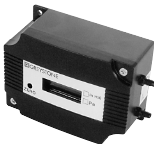
LP2 c/w LCD