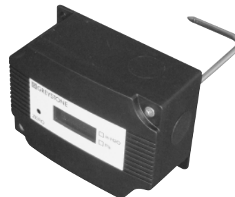
LP2 c/w LCD & integrated static probe