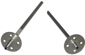
Pitot Tube HFO & HSO Series

The HFO and HSO series are used to sense velocity pressure or static pressure respectively. Available in 152 mm (6") length. Kits are available for differential and static that are complete with pneumatic tubing.