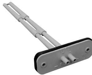
Differential Pressure Probe SSS Series

The HFO and HSO series are used to sense velocity pressure or static pressure respectively. Available in 152 mm (6") length. Kits are available for differential and static that are complete with pneumatic tubing.